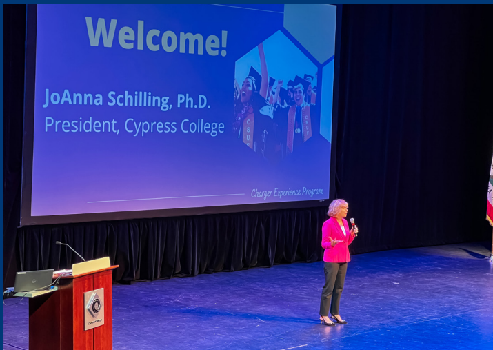
Cypress College welcomed more than 1,000 students, along with their parents to campus for New Student Welcome Night.